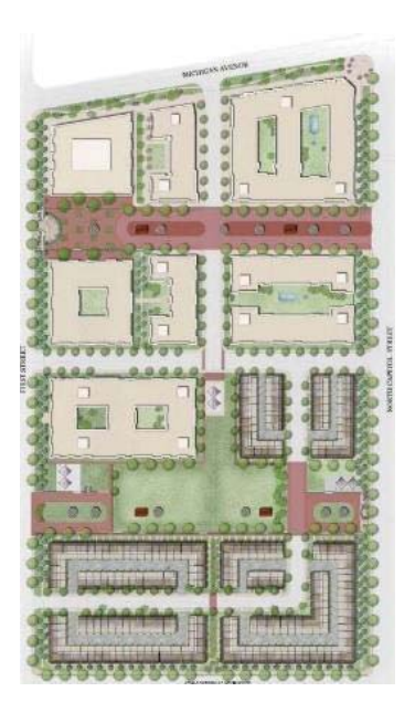
The 2009 Master Plan

98. The 2009 iteration of the Master Plan showed somewhat more tripartite organization.