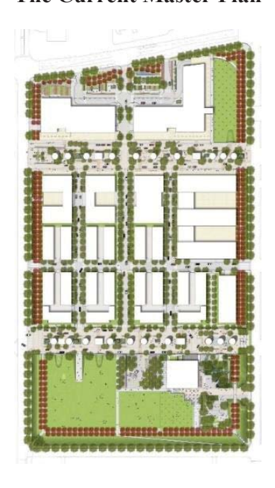
The Current Master Plan

100. With the 2012 plan, the Olmstead Walk emerges more on one side but the plan still lacked a tripartite organization, north/south view connections, or a complete plinth.