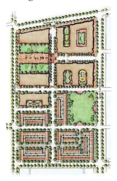
The Original 2006 Master Pan

96. In this first plan, development covers almost the entire site, there are no healthcare facilities, and little historic preservation. There is no plinth, Olmstead Wall, or South Service Court. There is only a partial North Service Court and minimal open space.