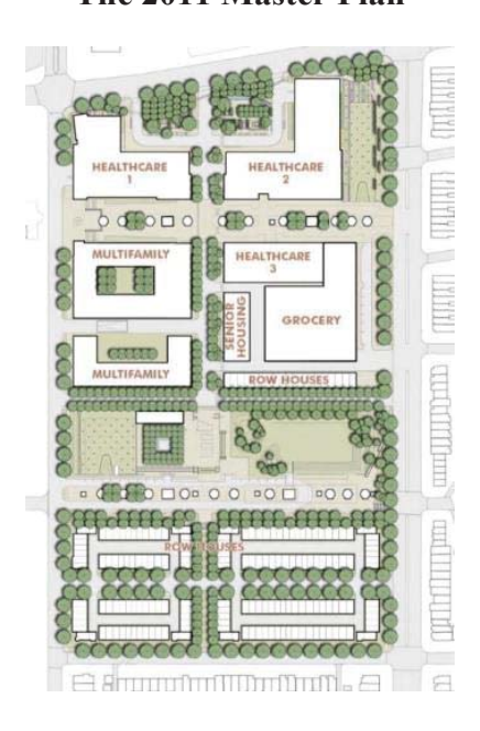
The 2011 Master Plan

99. Healthcare uses are introduced by the 2011 plan, which includes a much larger park stretching across the site from North Capitol to 1st Street, with views established. Cell 14 is included and preserved and Cell 28 is included into the park along with the. Community Facility. The Olmstead Walk and the plinth are