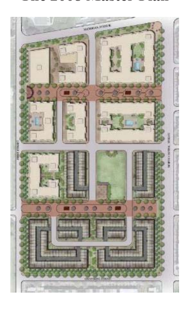
The 2008 Master Plan

97. The 2008 Master Plan included both the North and South Service Courts, but there is still no clear tripartite organization, no plinth or Olmstead Walk, no healthcare or community facilities, and minimal underground cell preservation.